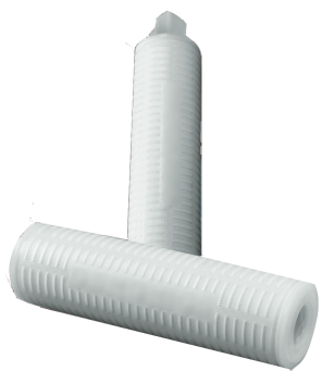
Figure 1: Flotrex PN Filters