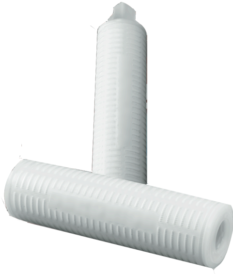
figure 1 : Memtrex MP-E (MMP-E) filters