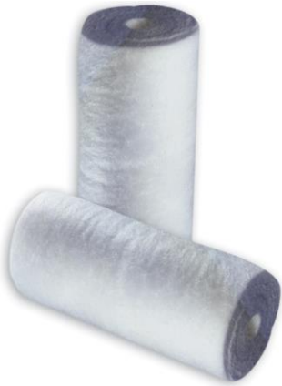
Figure 1: Aquatrex filters